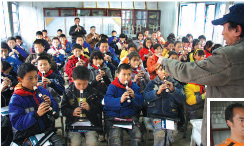
China: Helping Trauma Survivors of the Sichuan Earthquake: The Hanwang Flute Education Project