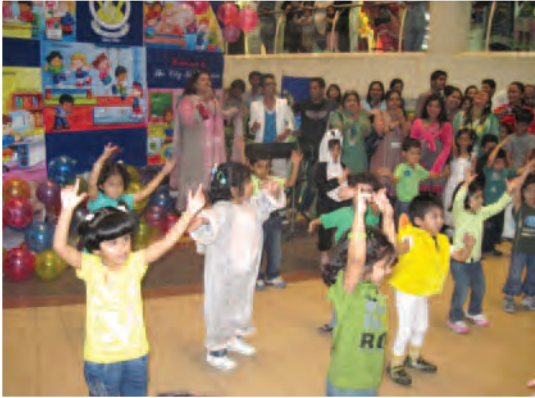
Pakistan: A Multi-Dimensional Approach to Education: The Prism Project