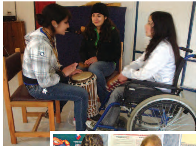
Chile: Using Music to Aid People Affected by the Chilean Earthquake of February 27, 2010: The Curepto Project