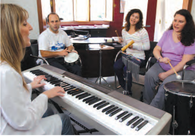
Argentina: Music Therapy for Children and Adults in Neurorehabilitation: The Institute of Cognitive Neurology