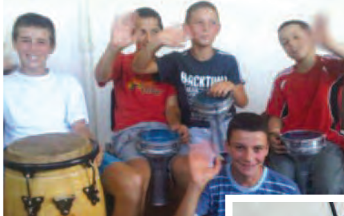
Bosnia and Herzegovina, Kosovo, Occupied Palestinian Territories, Rwanda, Uganda, UK: Using Music to Connect Communities, Bridge Divides and Heal the Wounds of War: Musicians Without Borders