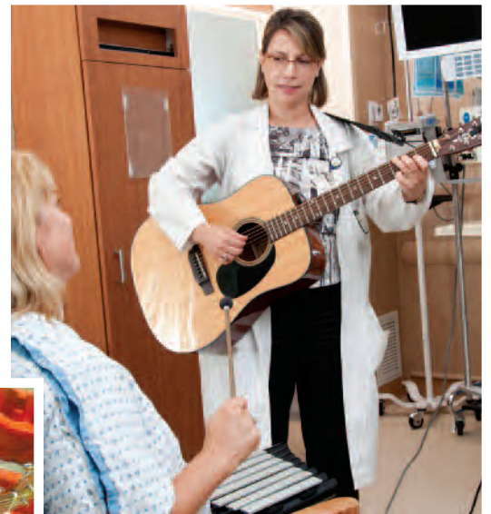
United States of America: Music Therapy in Cancer Care: Sloan-Kettering Cancer Center