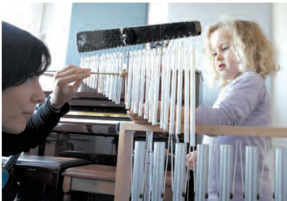
New Zealand: Music Therapy Services for Children and Young People with Special Needs: The Raukauri Music Therapy Centre