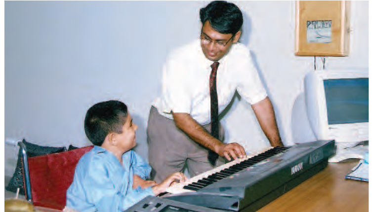
Pakistan: Music Therapy Centre for Adults and Children with Special Needs