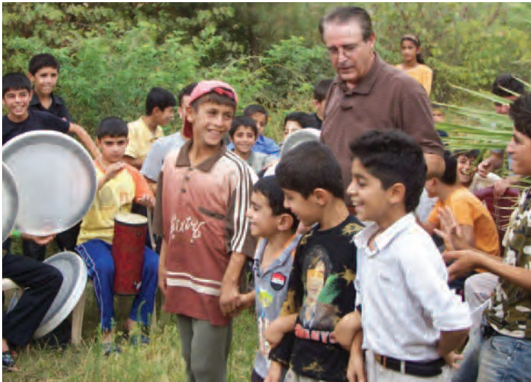
Indonesia, Iraq, United States of America: Recapturing Cultural Identity Through Drumming and Drum Making: Drums of Humanity