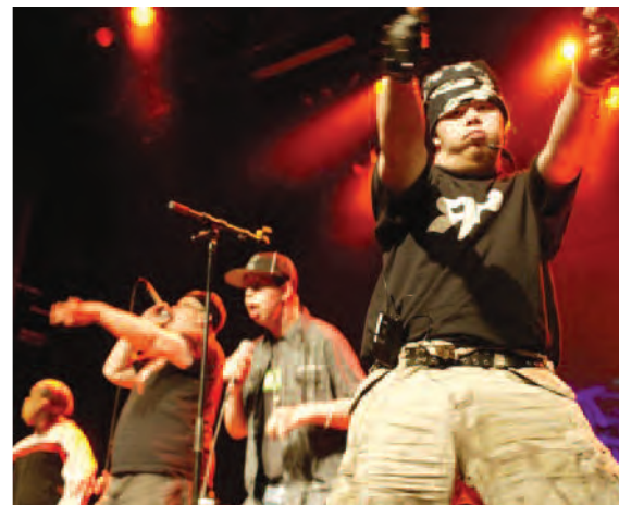
Finland: Music for Students with Special Educational Needs: Resonaari Music School