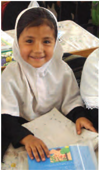
Afghanistan: Preserving and Returning the Musical Heritage of Afghanistan: Afghan Children's Songbook