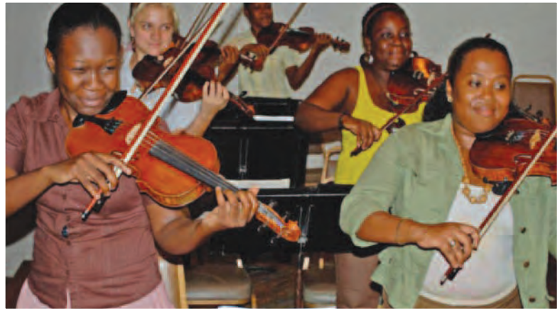
Haiti, Jamaica, Saint Lucia: Music for Social Change: Oasis-Caribbean