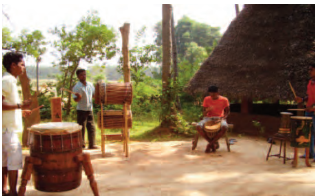
India: Musical Instrument Design and Construction in a Creative Community Enterprise for At-risk Youth: SVARAM