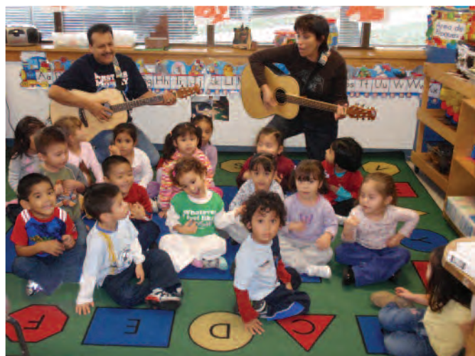
United States of America: Using Music as a Learning Tool for Economically Disadvantaged Children: Guitars in the Classroom