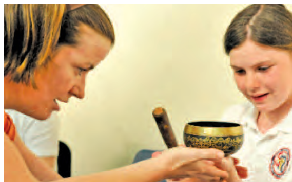
Ireland: Honoring the Music Cultures of the Traveller Community: The Nomad Project