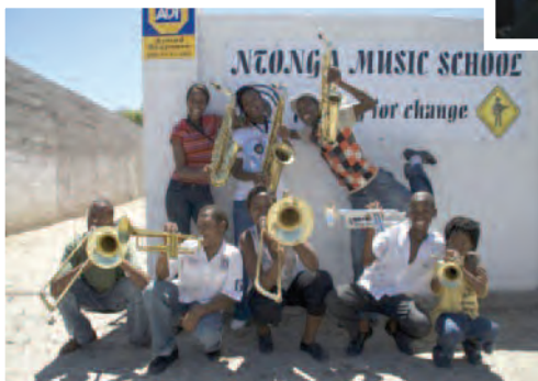
Multinational: Ntonga Music School: Playing for Change