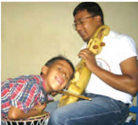
Nepal: Music Therapy for Autistic Children